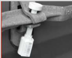
Plastic and metal bolt seal